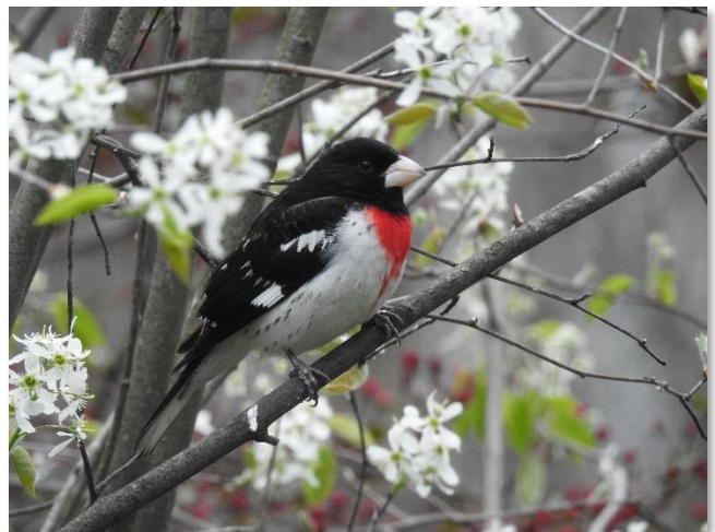
Rose-breasted Grosbeak observed through the bird observatory windows in April 2022.

Other bird observations are submitted to eBird, one of the world's largest biodiversity-related science projects with more than 100 million bird observations contributed annually by participants around the world. Nature Center staff and visitors alike contribute to the eBird database annually and documented 120 species of birds at the Nature Center during the 2021-2022 fiscal year.