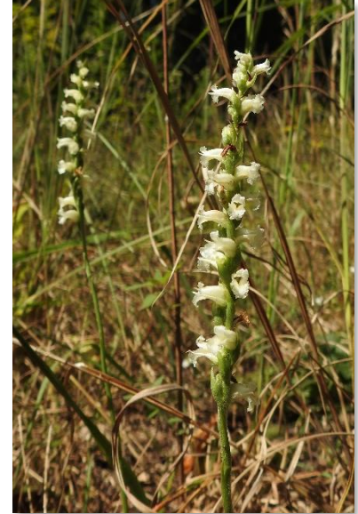
Nodding Ladies' Tresses, a native orchid, growing at the Nature Center.

"The nature center staff puts on great programs. Fantastic trails that are well maintained. Friendly and helpful staff. A must see bird room."