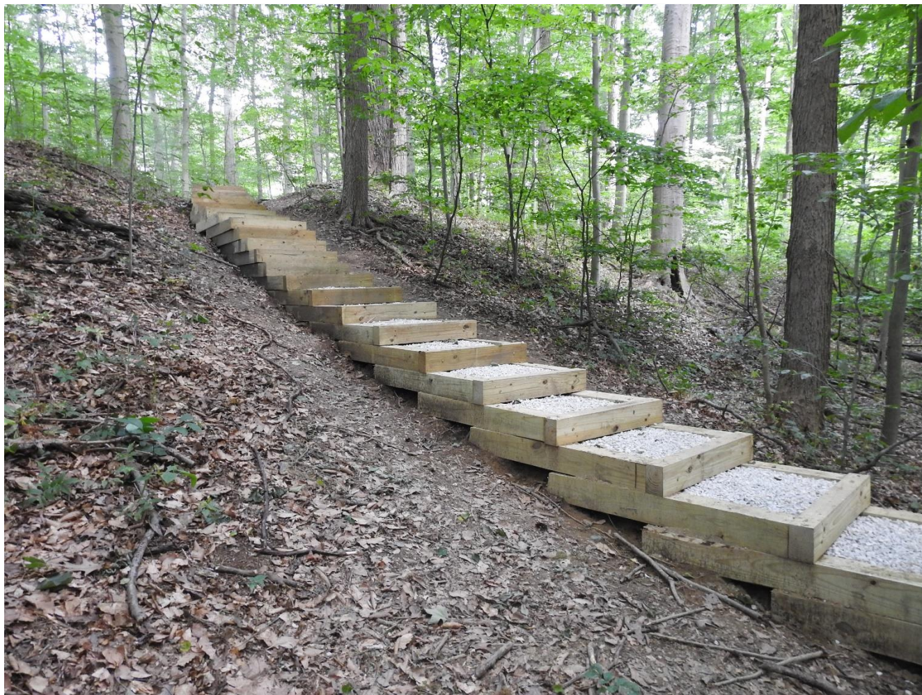
Wood and stone stairs installed on the Beech Trail enhance visitor access and mitigate erosion.

Eagle Scout project: stairs on Beech Trail (July 2021). Eagle Scout candidate Cory Miner from Troop 15 in Louisville replaced the washed-out stairs that connect Beech Trail to Succession Trail. Several weekends of work with scouts and volunteers completed the timber constructed stairs. They were backfilled with gravel making the climb out of the Succession Trail valley safer and sturdier.