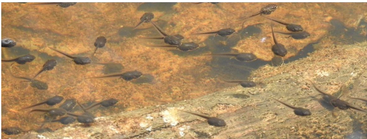
Wood Frog tadpoles in the vernal pool in April 2022.

“I love the vernal pool! The tadpoles are so fun to watch! I'm eagerly awaiting to see them get their legs, haha. I really enjoy visiting and walking/hiking the trails.”