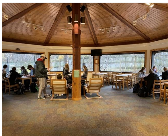
Students observing birds in Dr. Wu's BIO 141 lab in November 2021.