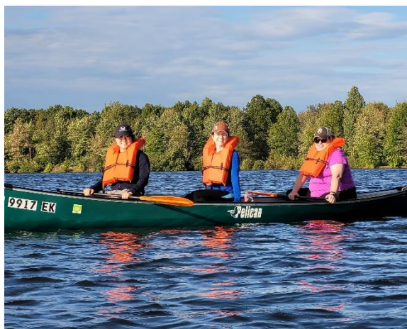
Canoeing with the Nature Center at Deer Creek Reservoir, Alliance, OH in September 2021.

New path lighting installed on the west side of the Visitors Center