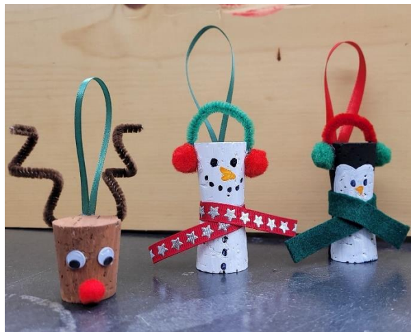
Free ornaments created during the Holiday Open House in December 2021.

Though the attendance numbers have nearly doubled versus the previous fiscal year, the 2021-2022 attendance figure is only two-thirds of the 5-year average prior to the COVID-19 pandemic. A good portion of the past fiscal year included mask requirements for indoor programs and modified event arrangements to encourage social distancing. We are hopeful that some events in the 2022-2023 fiscal year will return to their usual arrangement and that attendance figures will return to the average as well.