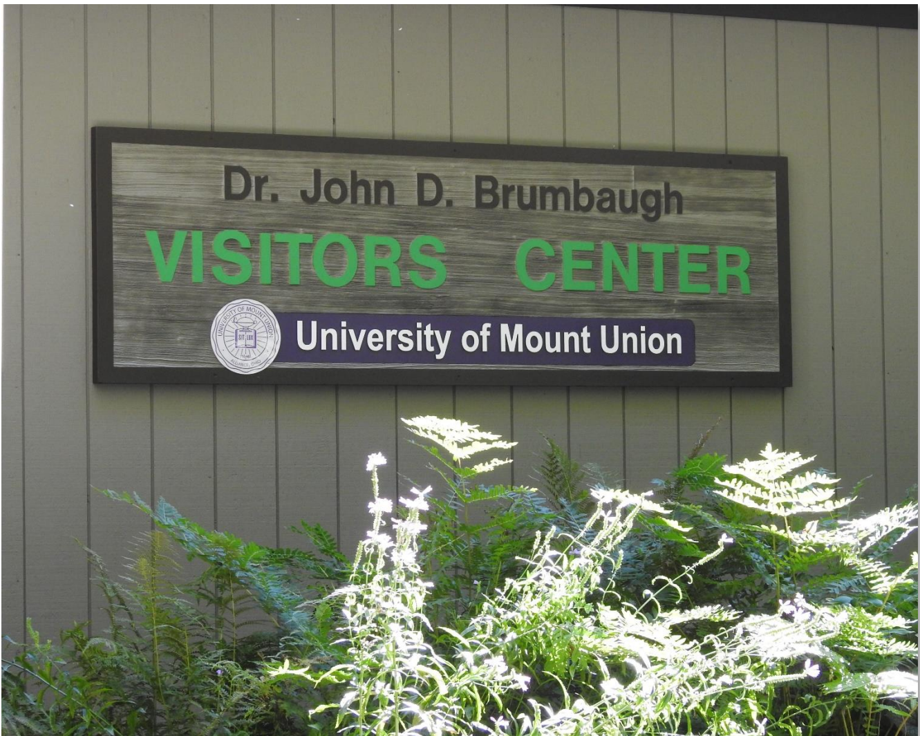
One of several new signs outside the entrance of the Visitors Center.

Along with programs and activities, the Nature Center staff are involved in academic support of Mount Union's students, conducting and supporting research, volunteer recruitment and retention, facilitating service projects, and the maintenance and improvement of the Nature Center's facilities and grounds.