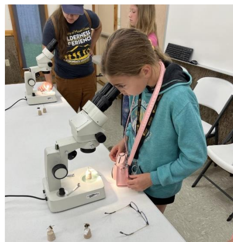
Marlinton students explore pollinators on a field trip at the Nature Center.

The 2021-2022 fiscal year saw participant numbers double over the previous year. The attendance figures are still far below the 5-year average (approx. 3,800) prior to the COVID-19 pandemic. As school districts continue to adjust to health and safety protocols and staffing shortages, we are hopeful that more schools will again consider the Nature Center for educational and experiential field trips as they did prior to March 2020.