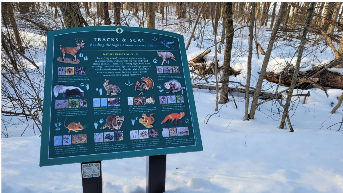
One of ten new interpretive signs to enhance visitor engagement and education on the Huston Farm Loop.